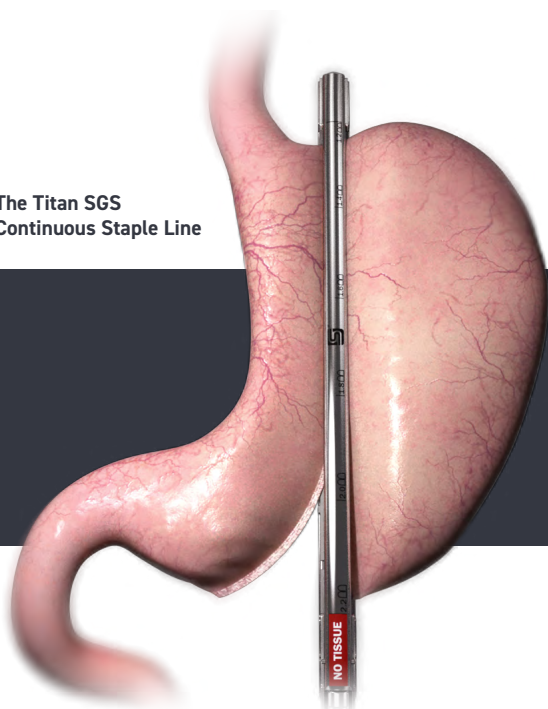
The Titan SGS Continuous Staple Line

Ask your doctor about weight loss (bariatric) surgery options and if the Standard Sleeve is the right approach for you.